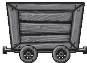
Word Search answer key