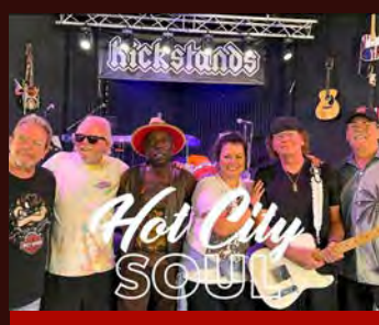
Hot City Soul Sat. on Main St. | 5 P.M