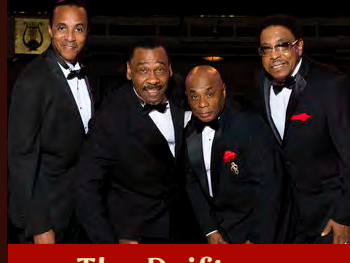
The Drifters Tues, on The Patio @ DMG